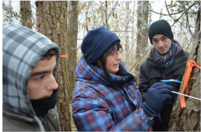
IV. Preparing tree rings cores